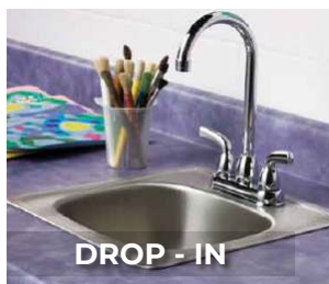
DROP - IN